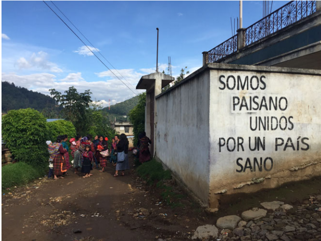
FIGURE 2. Women from one of the San Juan communities gather near a message from the NGO, Paisanos, which reads, “We are Paisano [country-folk] united for a healthy country.” [This figure appears in color in the online issue]

to increase resilience and empower women and communities to break the intergenerational cycle of poor growth and reduced lifetime health and opportunity” (Chomat 2015, viii). This language is resonant—even homonymous, we might say—with that used by USAID, which champions the importance of “fighting poverty to end the cycle of preventable child and maternal deaths so as to change the lives of women and their families.” Both Paisanos and Anne produce statistics of morbidity and mortality. They also employed the same women as assistants while interacting with the same households of marginalized women in their collection of data.